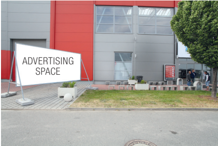
pic. no. 1