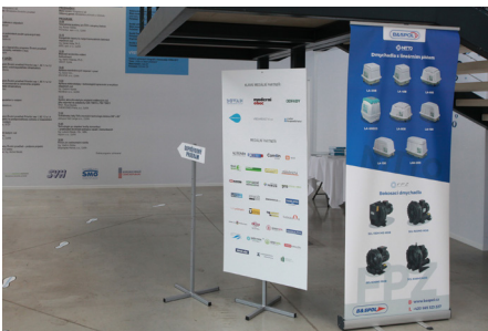
pic. no. 2