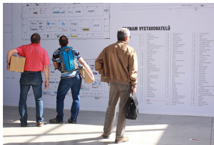
pic. no. 3