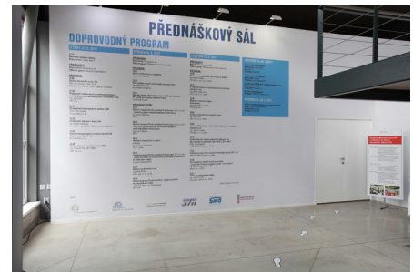
pic. no. 4

Do you want to promote your product not only in theory, but also in practice? Take advantage of placement at the entrance part of the exhibition area and show to your clients how it works.